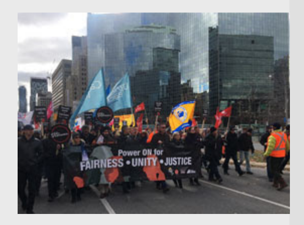
New labour laws will help millions of Ontarians.